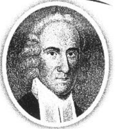
JONATHAN EDWARDS 1703–1758

Franklin's achievements brought him world renown. In 1756 British scholars elected him to the Royal Society, and in 1772 France honored him with membership in the French Academy of Sciences.