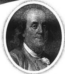
BENJAMIN FRANKLIN 1706–1790

Benjamin Franklin was one of the leading champions of Enlightenment ideals in America. Like other scientists and philosophers of the Enlightenment, Franklin believed that human beings could use their intellectual powers to improve their lot.